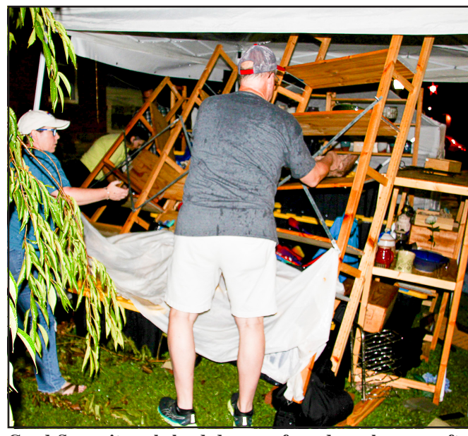
Good Samaritans helped dozens of vendors clean up after

downtown roundabout. Not every vendor was hit, but an estimated 60% of vendors suffered some form of wind and water damage as See Music & Moonshine, Page 6A