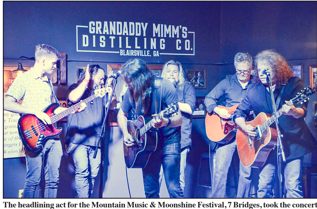
indoors due to bad weather on July 29.

the storm moved in from Pat indoors before the rain. Haralson Drive and swept past the courthouse, disappearing nearly as quickly as it started but not before wreaking tremendous havoc.