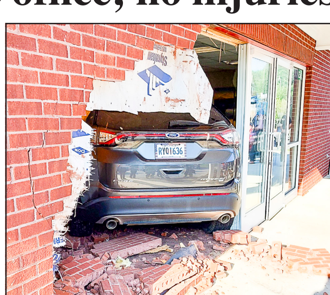
building through the wall to the Here's something you don't see every day, and thankfully, no one was injured after this car crashed through Trinity Primary Care.

At 8:22 a.m., a Ford Edge traveling west in the parking lot made a left turn to park out front for a lab visit. Unfortunately, the driver pressed the gas pedal instead of the brake and drove into the left of the front door, according See Trinity Car Crash, Page 3A