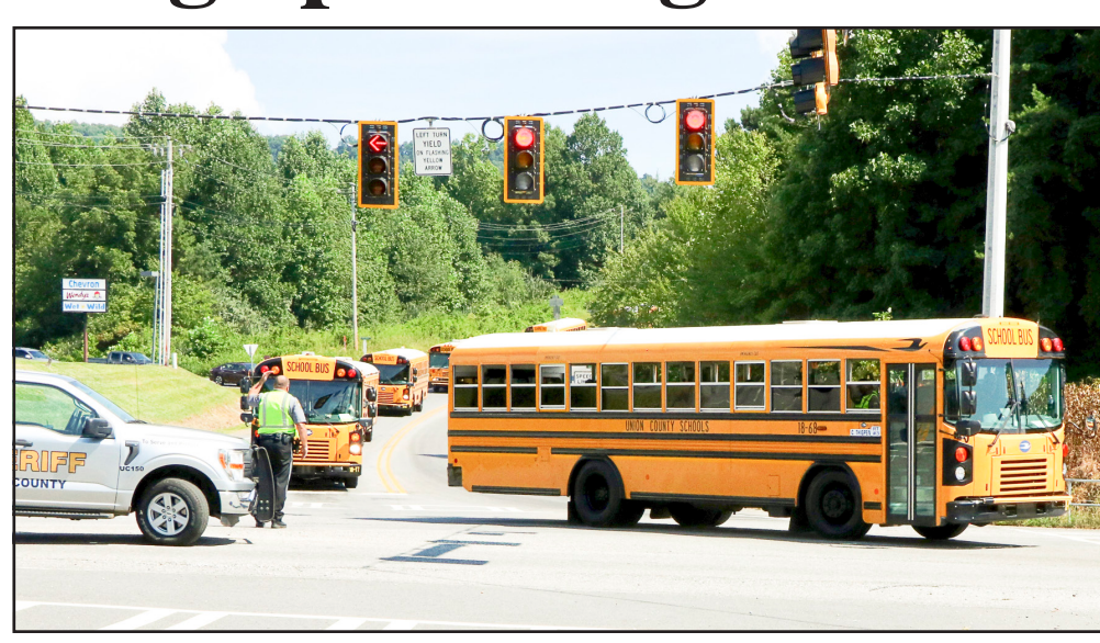
Union County School buses will be hitting the roads again when the new semester begins