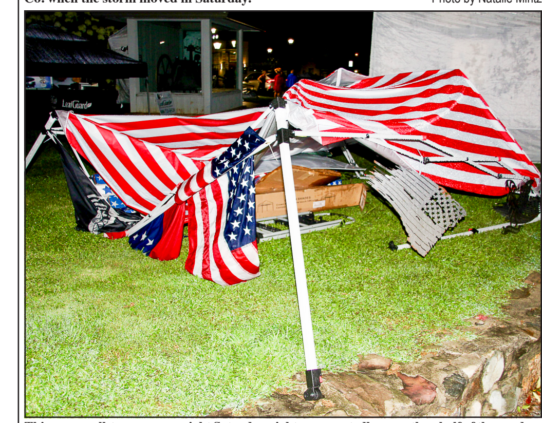
This was an all-too-common sight Saturday night, as reportedly more than half of the vendors in the Mountain Music & Moonshine Festival received some type of storm damage.